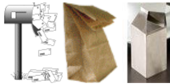
Junk Mail / Paper Bags & Cartons