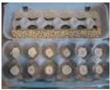
Paper Egg Boxes