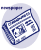
Shredded & Newspaper