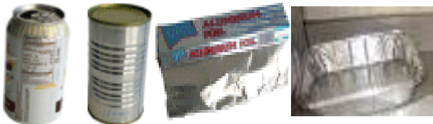
Tin & Aluminum Cans, Foil & Pans